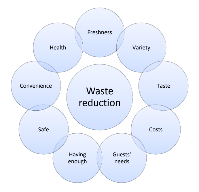
Figure 2: Competing goals to food waste reduction

Understanding food management behaviours and the occurrence of food waste better as well as understanding and influencing competing goals is an important step for a targeted policy response.